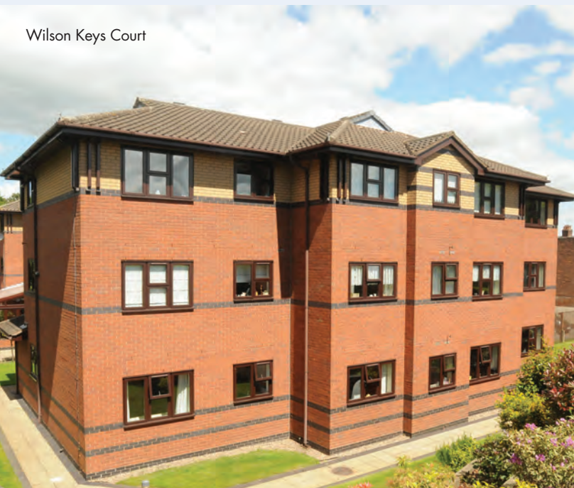
Wilson Keys Court